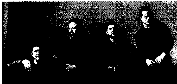
7 th TIME DOWN & FINDING FAVOUR Saturday, August 5, 2017 in the Amphitheater

Ticket Prices: $15.00 presale - $18.00 at the gate - $10.00 children 12 & under 4H Exhibitors: $2.00 – Tickets Available at the Fair Office 1 Hour Before Showtime